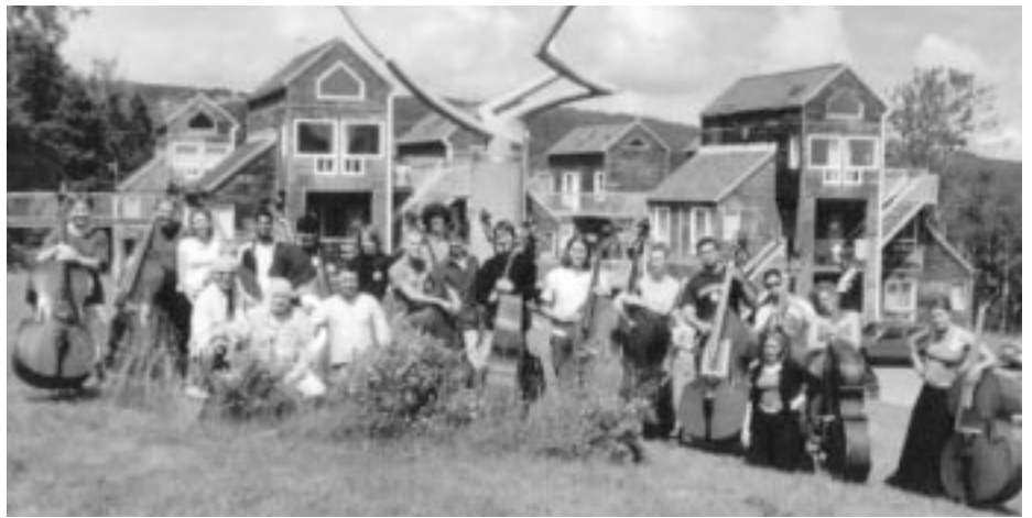
The bass class of the 2004 Domaine Forget Music Festival.