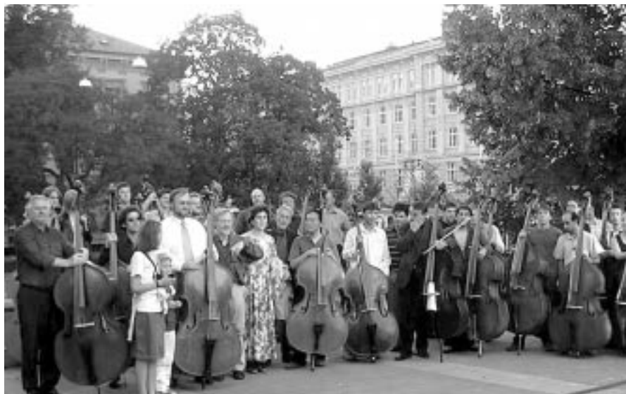
Participants in the fifth international double bass convention in Brno, Czech Republic.